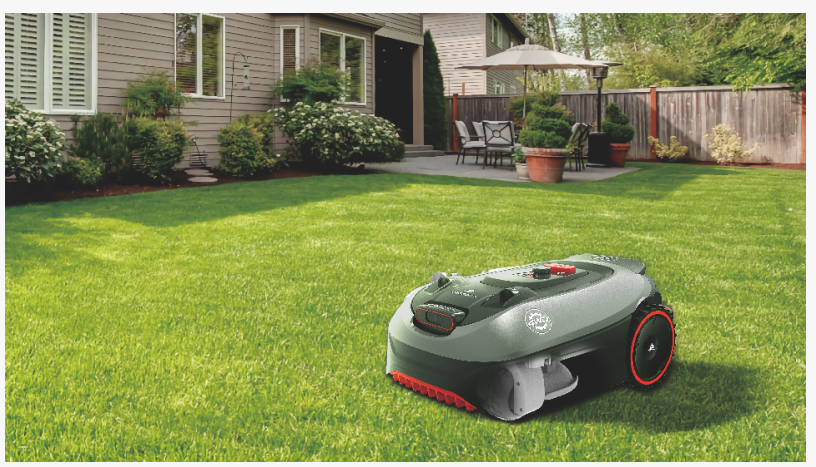
Yard Force REVOLA iVR16 in the garden

perimeter wire installation, allowing homeowners to complete set-up in under 30 minutes - True 4-Wheel-Drive Agility – The flagship iVR16 model uses hub-motor AWD to master uneven lawns and slopes approaching 35 degrees while maintaining a consistent cut