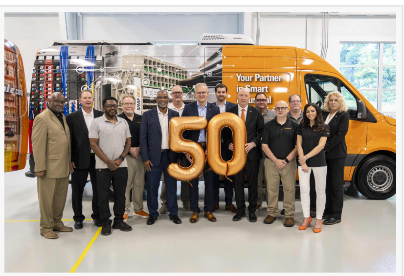
Weidmuller USA Employee Hall of Fame recipients with company leaders

"The Richmond headquarters expansion marks the start of an exciting and long-planned transition to