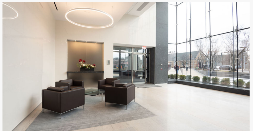
Lobby of the Gateway Building in White Plains, New York.

WHITE PLAINS, NY, UNITED STATES, June 16, 2025 /EINPresswire.com/ -- On Monday, June 23, 2025, intellectual property law firm Leason Ellis LLP is moving to the Gateway Building in downtown White Plains, New York at One North Lexington Avenue.