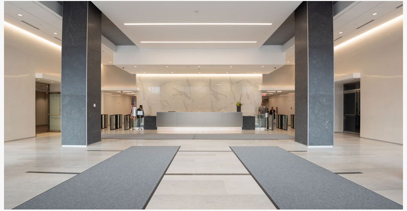
Main reception area of the Gateway Building in White Plains, New York.