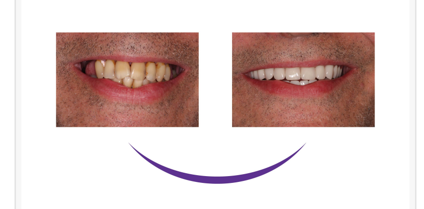
Transforming Smiles. Transforming Lives.

For more information, please visit <a href="https://www.dejesusdental.com">www.dejesusdental.com</a> or contact: