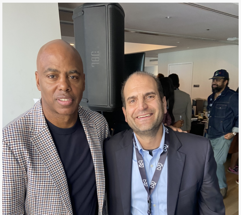
TravelingWiki Foundation Discussing its Non Profit Work with the Co-Host of Entertainment Tonight, Kevin Frazier