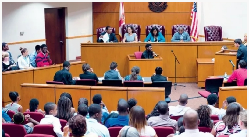
FYED Teen Court

Foundation for Youth & Economic Development