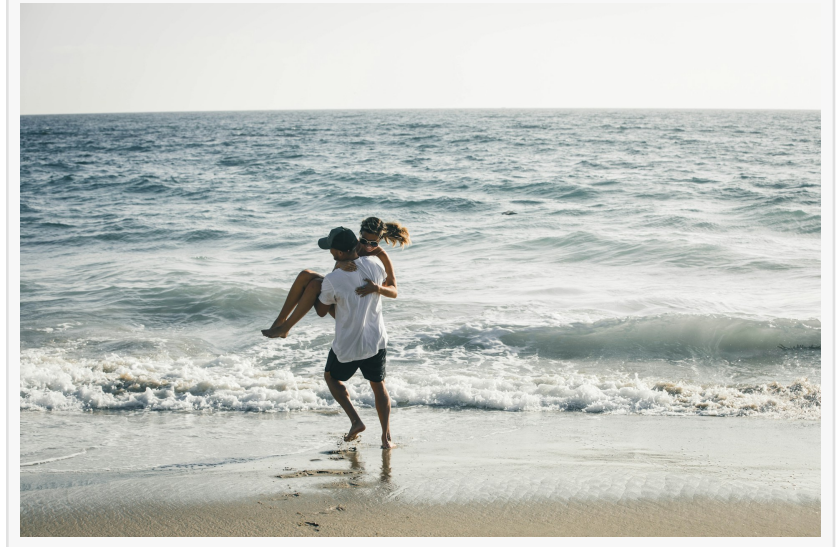
couple enjoying time together on a California beach—symbolizing hope and healing after recovery.