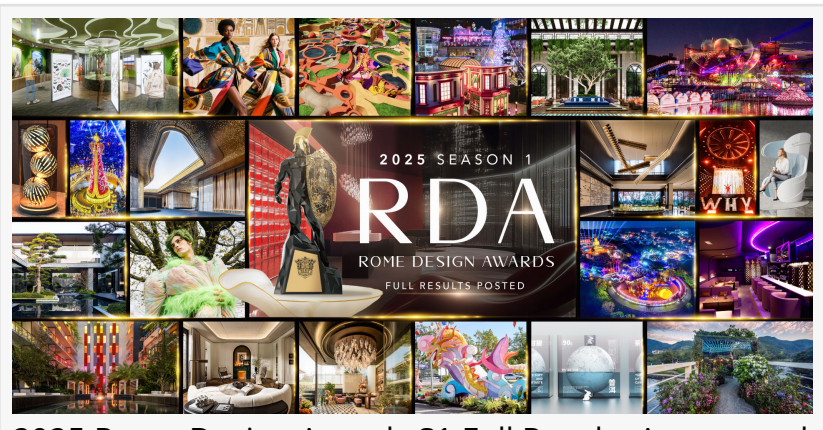
2025 Rome Design Awards S1 Full Results Announced

NEW YORK, NY, UNITED STATES, June 17, 2025 /EINPresswire.com/ -- The International Awards Associate (IAA) proudly announces the winners of the 2025 <u>Rome Design Awards</u>: Season 1, honouring the most innovative and