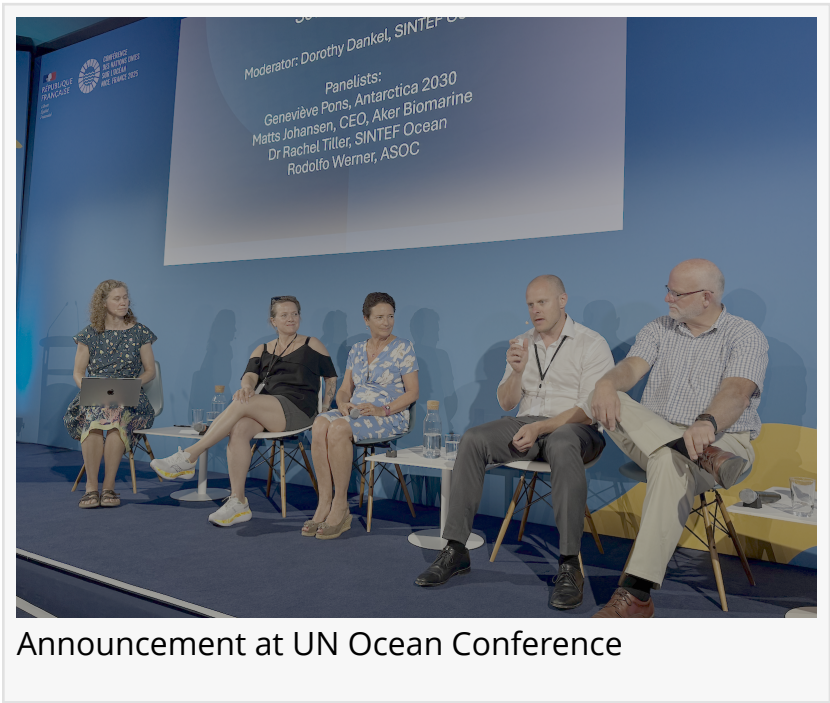
Announcement at UN Ocean Conference

00 000 00 000000 00000000000 0000, 0000 00000 00000000 000 0000 0000000000 0000000000 000000 000000000 0000000000 000 000 0000000 0000000000 000000 (0000) 00 00000000000, 00000000 00 0000000000 00 00 0000000000 000000000000 00000000 000 00000000000000 0000 0000 0000000000 0000000 000 00000000000. 000 000000000 000 0000 00000000 0000000 00% 00 000 00000000000 00000000000.