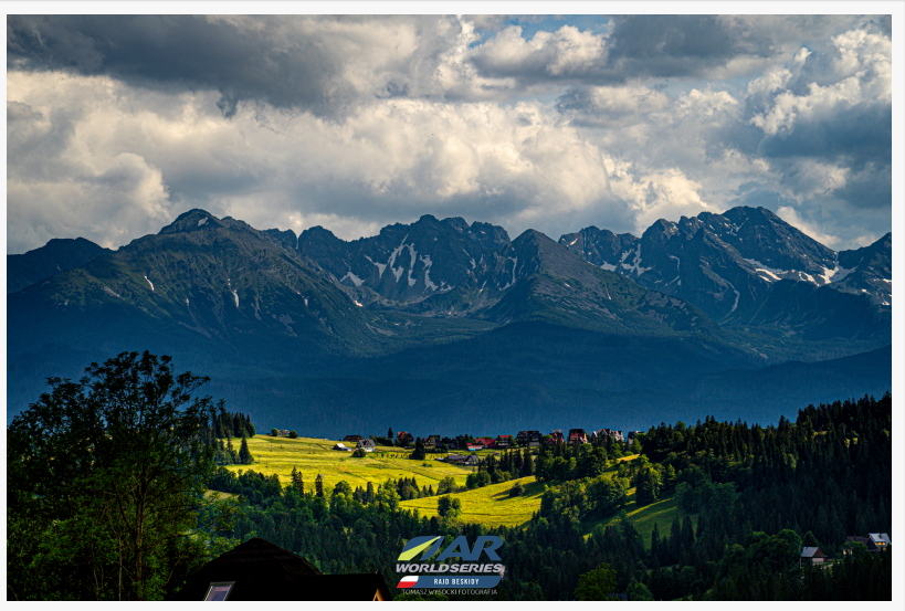
View of the Tatra Mountains - Rajd Beskidy

Teams will gather at the ECO Active Resort Pieniny this weekend read to start the race at 10 a.m. on Monday and have a time limit of 122 hours to complete the course. This is split into approximately 420km of mountain biking, 110km of trekking and 50km of water activities, which will include some swimming.