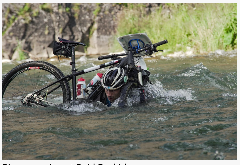
River crossing at Rajd Beskidy

Also racing is the second placed team from last year, Team Untamed, with a line up from Switzerland and Czechia, and the youth team winners from last time, Team Aaros of Denmark.