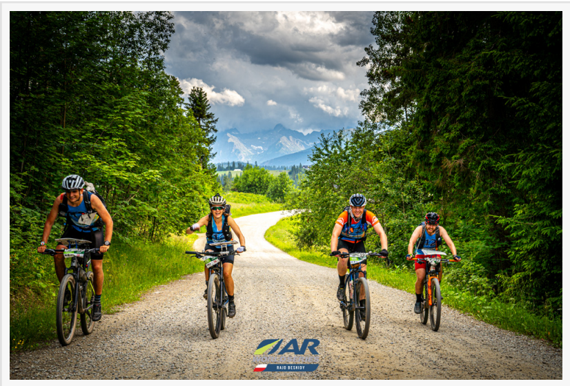
Mountain Biking at Rajd Beskidy

PIENINY, LESSER POLAND VOIVODESHIP, POLAND, June 13, 2025 /EINPresswire.com/ -- Rajd Beskidy is set to challenge teams on a 580km course through the low Tatra mountains of Poland and Slovakia next week, and the race organsiers say; "It's going to be tough — even devilishly tough."