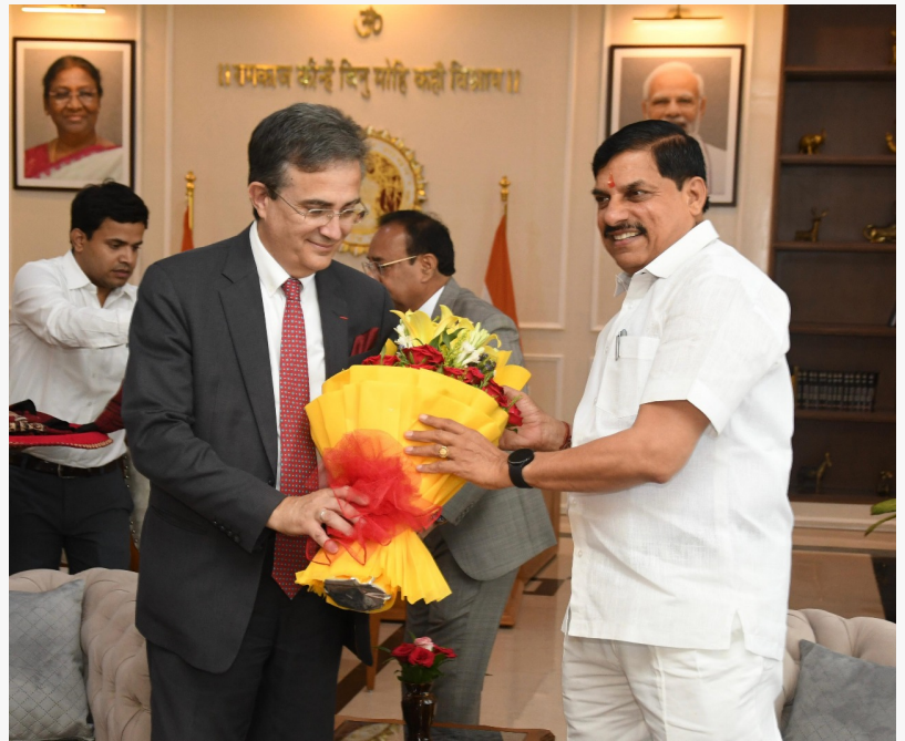
Hon'ble CM Dr. Mohan Yadav Felicitates French Ambassador H.E. Dr. Thierry Mathou

This partnership marks a new chapter in Indo-French cultural collaboration, focusing on artistic exchange, joint cultural programming, educational