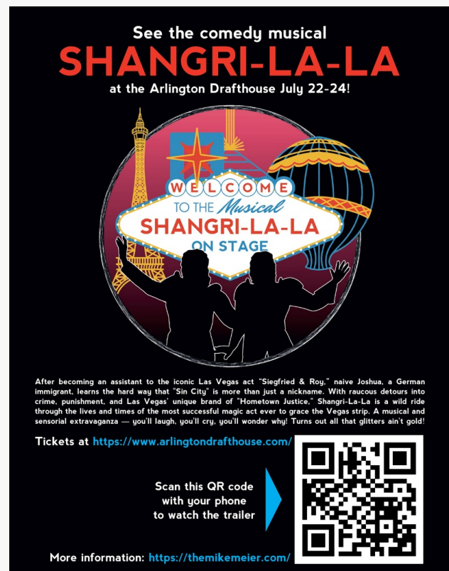
Poster for the Shangri-La-La musical at the Arlington Drafthouse Theater, Virginia.