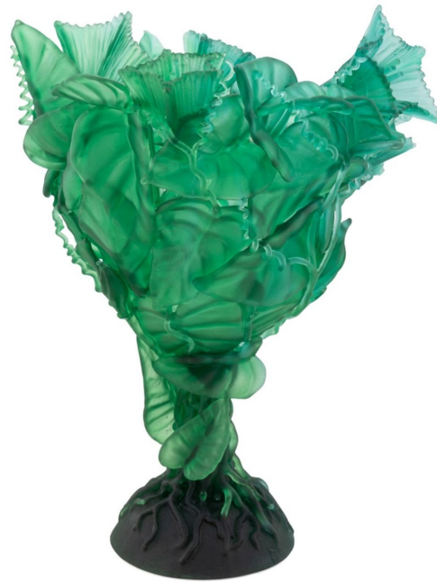
Cast glass floral sculpture by Evelyn Dunstan (New Zealander, b. 1961), titled Conundrum 6 Contrary (2009), artist signed, dated and titled to the underside, cipher marked to the side of the foot ($5,142).