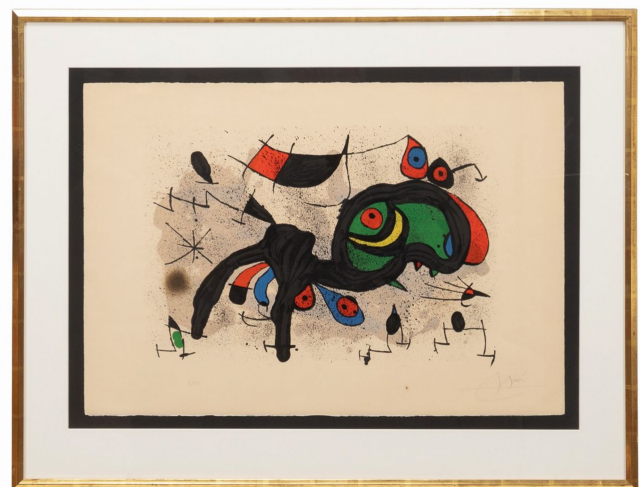
Color lithograph on Arches paper by Joan Miro (Spanish, 1893-1983), titled Le Belier Fleuri (The Flowery Ram) from 1971, 21 ¼ inches by 30 ¼ inches, signed and numbered (3/75) ($6,655).