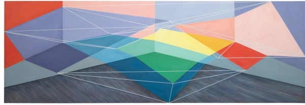
Unframed and monumental acrylic on canvas painting by Lydia Okumura (Brazilian, b. 1948), titled Phenomenon (1985-87), 50 ¼ inches by 148 inches, artist signed and dated ($5,748).

A large abstract acrylic on canvas painting by Jack Bosson (American, 20th century), titled Cholly Cave (1980), entered the auction with a mere $900 high estimate, but bidders pushed that to $4,538. The 66 inch by 73 ¼ inch (canvas, less the frame) was artist pencil signed, titled and dated to verso.