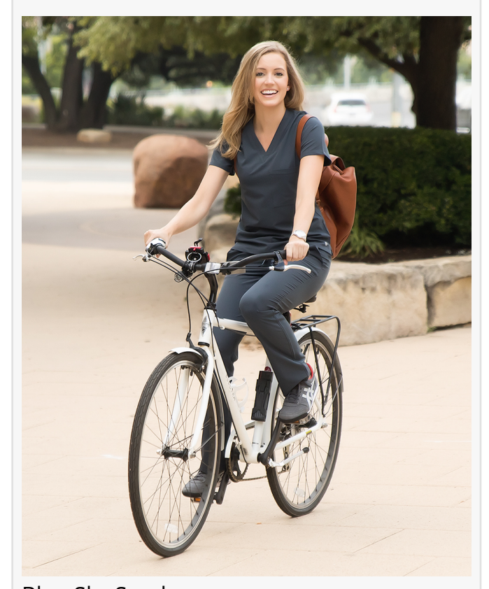
Blue Sky Scrubs

Behind-the-scenes of how sustainability drives product design