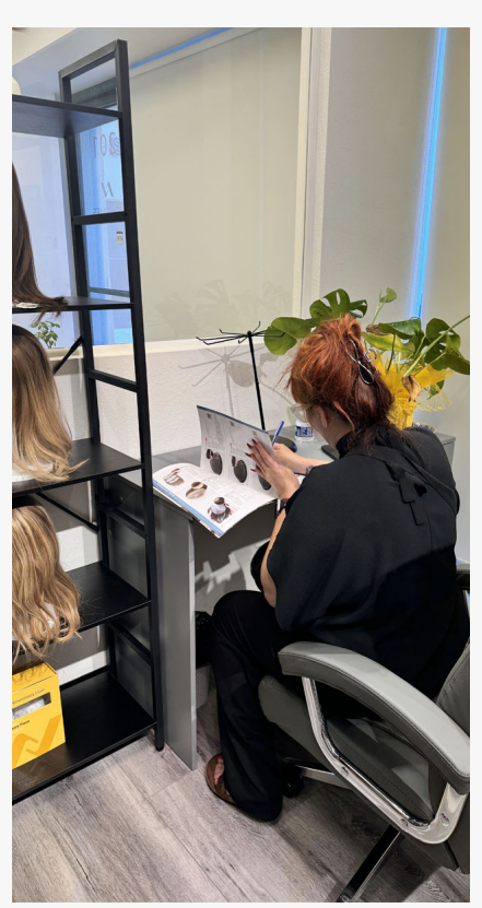
Newtimes Hair Global Supply Warehouse

around the realities of running a modern salon. You order, we deliver—quickly, clearly, and reliably."