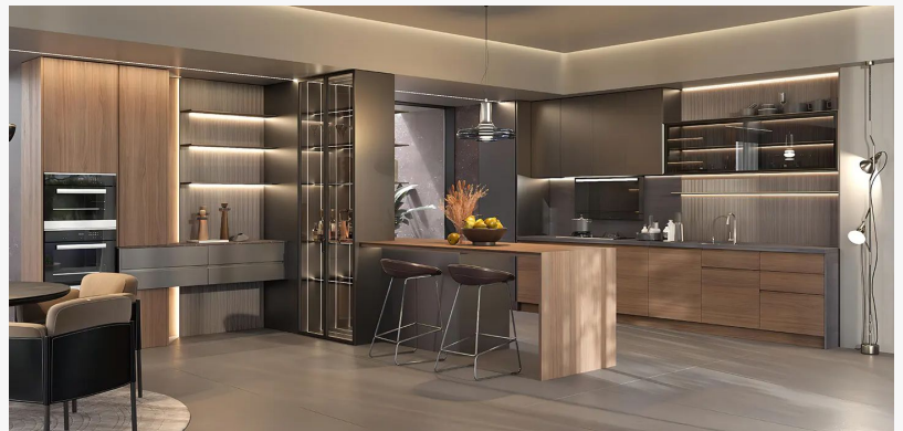
oppein modern walnut veneer and grey custom kitchen cabinets