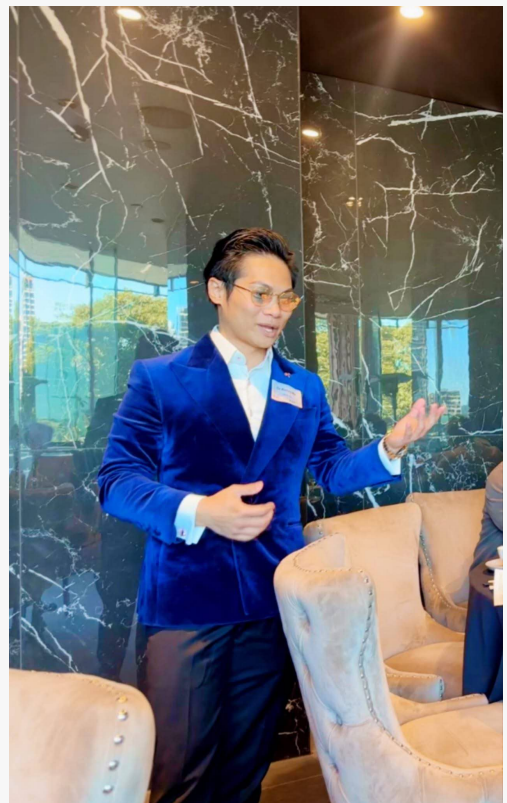
InvestHK co-organised a networking event in Brisbane