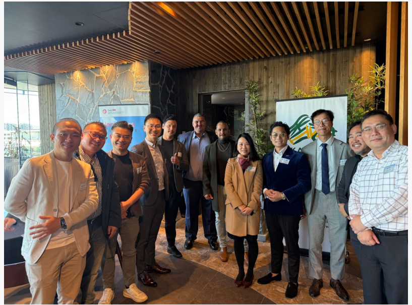
InvestHK co-organised a networking event in Brisbane 2025