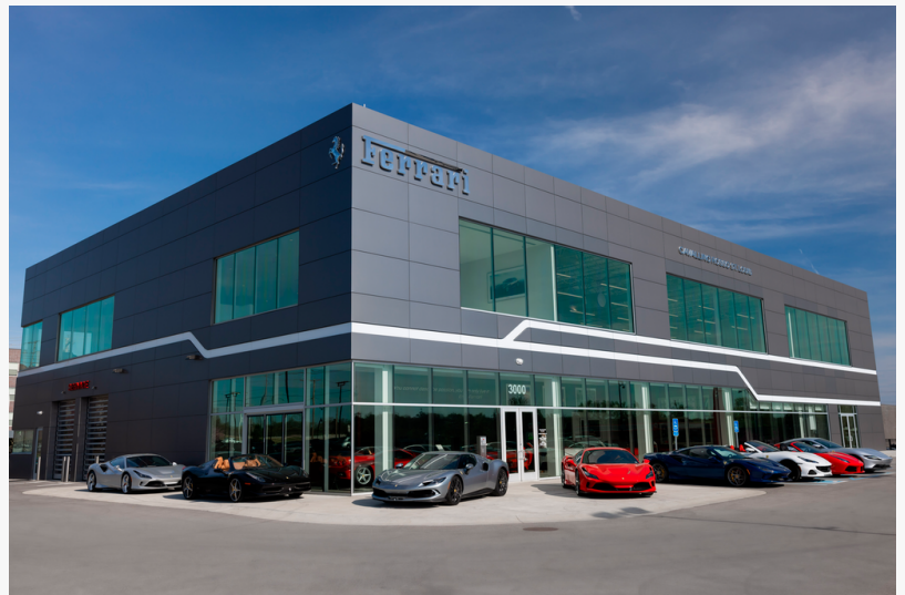
Cavallino Rosso St. Louis