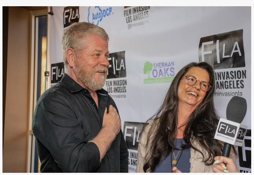
Film Invasion-Los Angeles (Red Carpet)-1

Taking great pride in programming great films and serving its filmmakers with an unrivaled experience, the acclaimed festival screens all films over the 3-day weekend, never mid-week - allowing maximum ability for participation by filmmakers and for film-lovers to come, enjoy and celebrate the magnificent art of film. EVERY short film receives its own 15-minute Q&A and there is none of the standard 'bundling' of films. No afterthoughts. Every filmmaker gets their