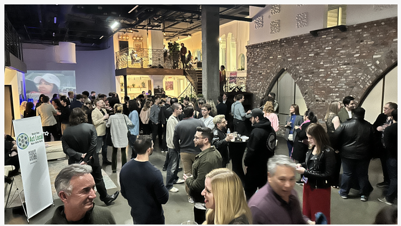
Film Invasion-Los Angeles (Opening Gala Event)