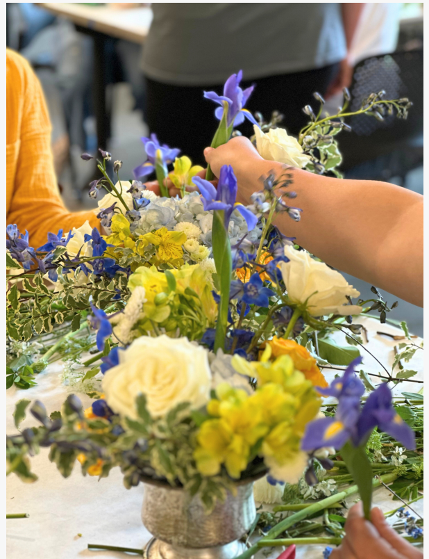
Althea Wiles teaches participants in her "Floral Design FUNDamentals" workshop during Art in Bloom weekend, where attendees created arrangements inspired by Clara Driscoll's Wisteria Table Lamp.