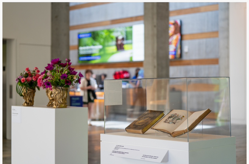
Althea Wiles' 2025 Art in Bloom installation "The Flowers Personified" features floral arrangements inspired by J.J. Grandville's anthropomorphized botanical illustrations.

With over 30 years of experience in the floral industry, Wiles has become a respected fixture in the Art in Bloom exhibition. Her previous works have drawn inspiration from iconic pieces in the museum's collection, including Dale Chihuly's Azure Icicle Chandelier and Karen LaMonte's Dress Impression with Wrinkled