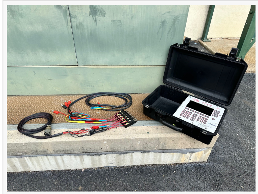
SSM-6330-KIT Substation and Intertie Tester with the TESCO 6330 Site Analyzer

• Engineered & Manufactured in the USA – Built to meet the toughest demands in the field.