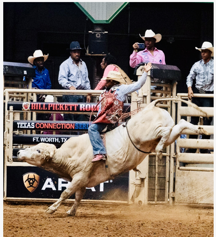
BPIR Texas Connection Series Bull Rider