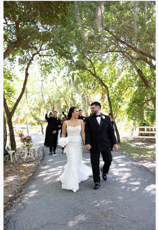
Whispers in the Woods – A Bonita Ranch Love Story

Today, agritourism in Florida and across the U.S. includes much more than farm tours. Wedding venues like Bonita Ranch blend agriculture, tourism, and hospitality into one immersive experience. For farms and nurseries, opening up to events helps diversify revenue streams while