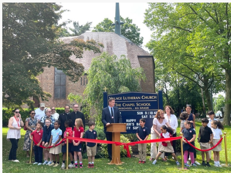
Students, faculty, parents, civic leaders, and faith partners

Founded in 1947, The Chapel School in Bronxville, NY, provides a nurturing, faith-based education for students from preschool through grade eight. A ministry of Village Lutheran Church, The Chapel School is known for academic excellence, character formation, and its