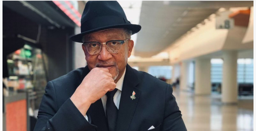
Dr. Benjamin F. Chavis, Jr.

NEW YORK, NY, UNITED STATES, June 17, 2025 /EINPresswire.com/ -- As the nation marks Juneteenth—commemorating June 19, 1865, when federal troops enforced the Emancipation Proclamation in Texas—Dr. Benjamin F. Chavis Jr. calls for a deeper reckoning with the global and generational impact of the Transatlantic Slave Trade .