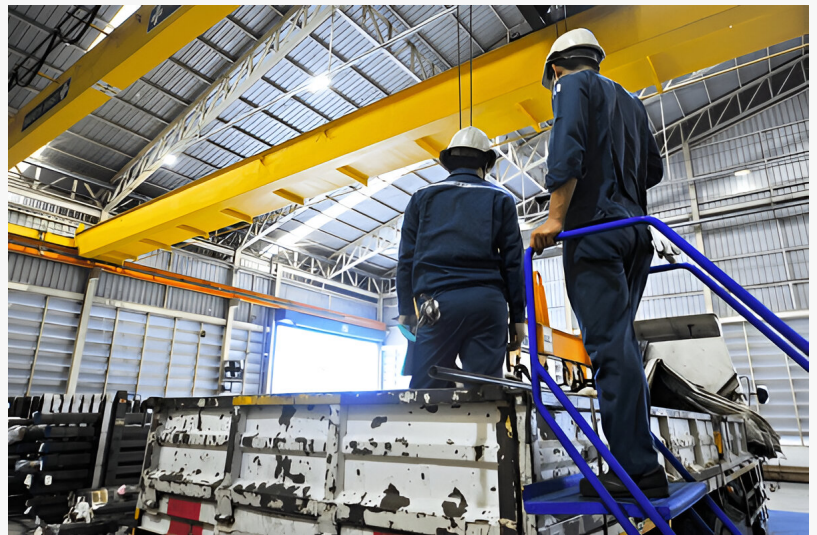
overhead crane training