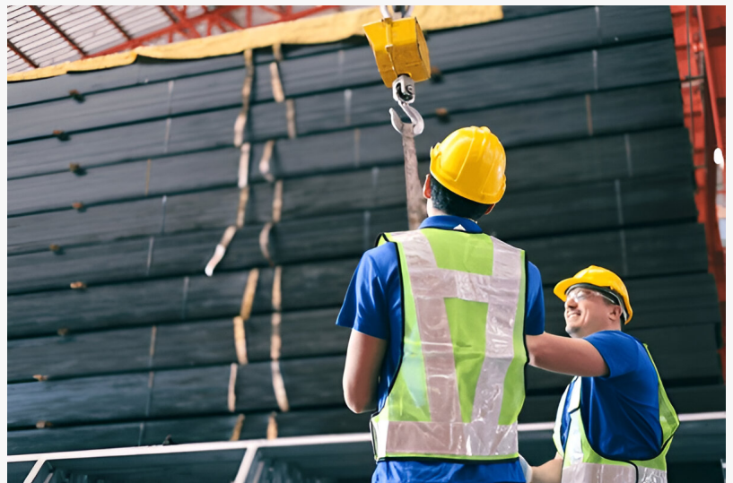
overhead hoist safety training

Practical scenarios are integrated into the learning experience to simulate everyday challenges faced in hoisting environments. By combining technical instruction with field-relevant activities, the training ensures that learners gain the confidence and competence required to operate