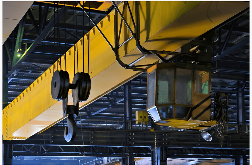
overhead crane and hoist training