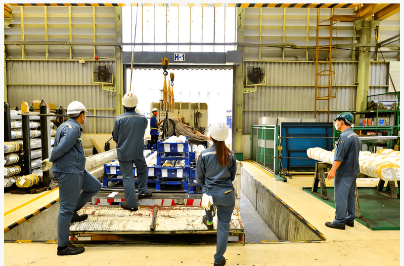
overhead crane safety training