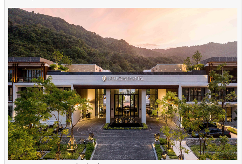
InterContinental Phuket Resort

sophistication. Set on the white sands of Kamala Beach, the resort blends elegant design with the natural beauty of Phuket's west coast. Sati Spa is one of its crown jewels, offering guests an exceptional wellness experience as part of a memorable stay.