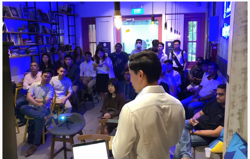
Angel School Masterclass