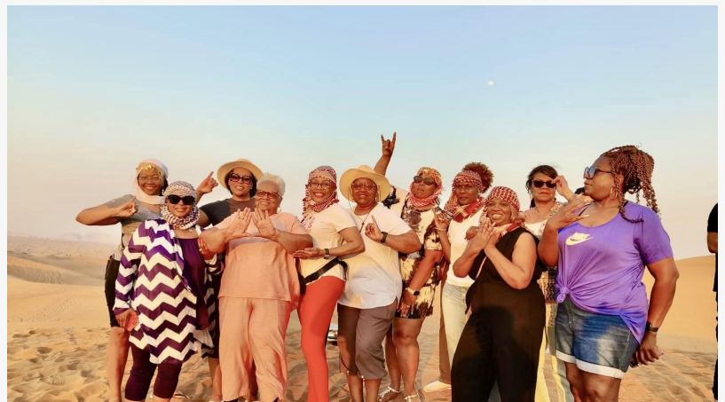
Culture Holidays' Dubai Trip

Culture Holidays is widely known for offering signature experiences such as the Millionaire Mindset Trip in India, Blossom Bliss Retreat in Zanzibar, and its sought-after FAM Trips that combine education, commissions, and companion access. With a mission rooted in purpose-driven travel, every trip booked also contributes to feeding underprivileged children through its