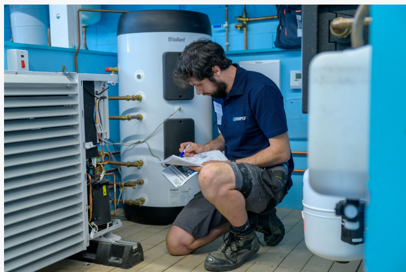
SPAY 50 Renewable Technologies competition: Preparing the next generation of plumbing professionals to install and maintain low carbon heating systems, including heat pumps, which will become an increasingly important part of the job.