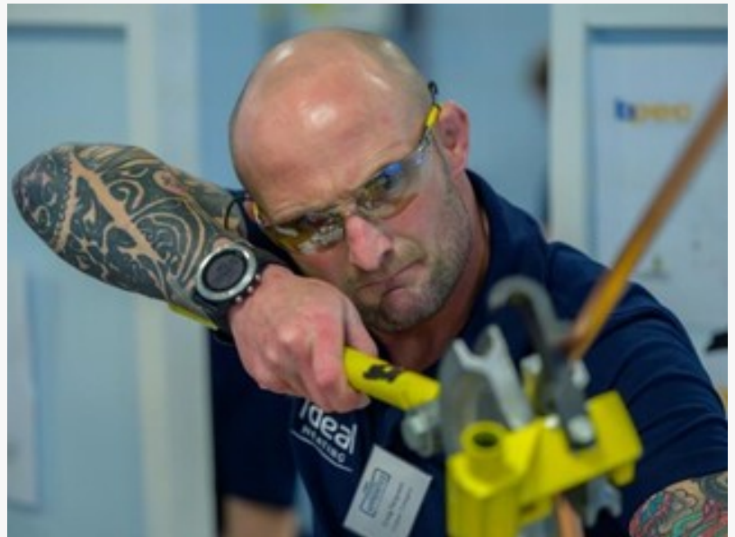
SPAY 50 Copper competition: Testing precision, craftsmanship and real-world problem-solving skills in one of the most fundamental areas of plumbing installation.