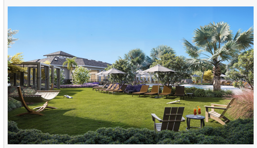
Rendering Green Space - Baldwin East

residential, commercial and industrial projects. Through its sister company, Hedrick Brothers Construction, a trusted name throughout the state of Florida in the construction industry since 1979, they can provide integrated vertical services to streamline the complete development process. With a long-term vision and a deep commitment to integrity, innovation, and value creation, Hedrick Brothers Development leverages its deep-rooted industry expertise and