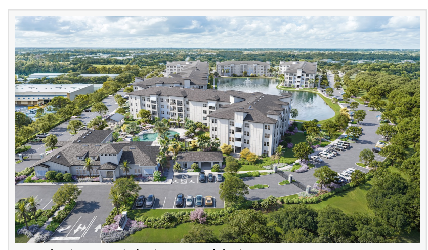
Rendering Aerial View - Baldwin East

ORLANDO, FL, UNITED STATES, June 17, 2025 /EINPresswire.com/ -- Hedrick Brothers Development, a full-service real estate development organization which develops, owns and manages institutional-grade residential, commercial and industrial projects, broke ground on Baldwin East Apartments, a four-story 363-unit