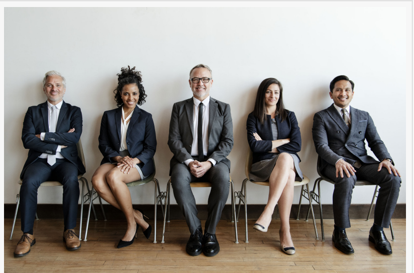
dental assistant jobs Ireland

CORK, CORK, IRELAND, June 17, 2025 /EINPresswire.com/ -- Ireland's healthcare sector is undergoing a significant transformation; nowhere is this more apparent than in dentistry. Across the country, clinics are sounding the alarm about unfilled positions, long waiting lists, and shrinking access to essential care. For professionals in the field, however, this moment represents more than just a challenge—it offers a golden opportunity.