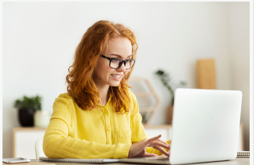
dental nurse jobs dublin