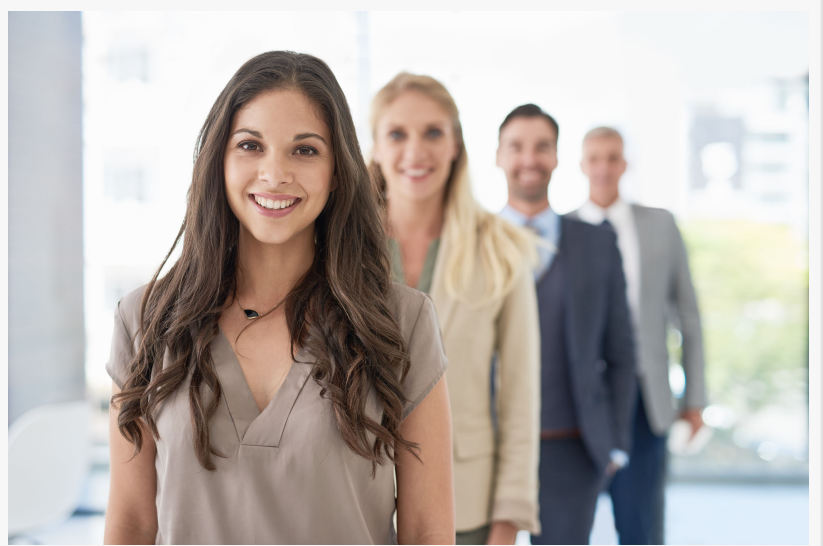
Dentist Jobs Ireland