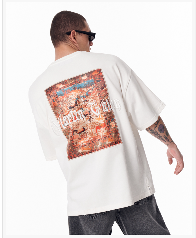
Ethnic Pattern Black Oversized T-shirt