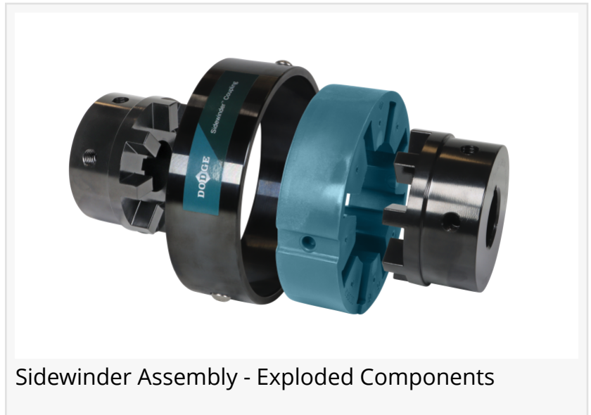
Sidewinder Assembly - Exploded Components

This innovative approach provides better resistance to wear and fortifies the coupling element, directly contributing to extended service life.