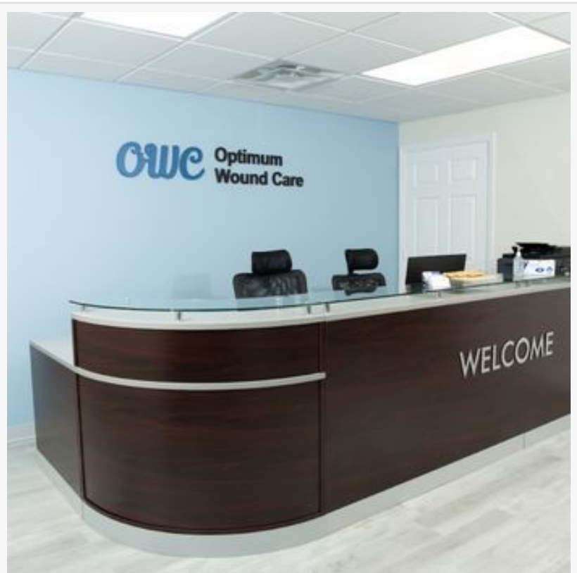
Welcome to Optimum Wound Care — where healing begins in a warm and professional environment.

The care team includes physicians, nurses, and therapists trained in advanced wound healing modalities. Each treatment plan is customized not only to the wound type but also to the patient's lifestyle, mobility, and comorbid conditions. This individualized care has contributed to healing times that exceed national benchmarks.