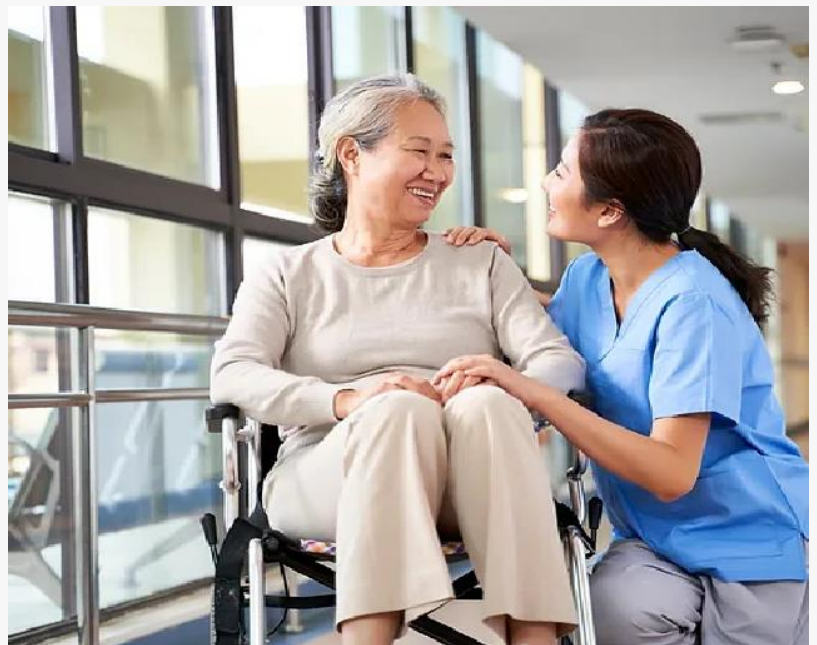
Expert care, real results - our patients receive the highest standard of wound management.