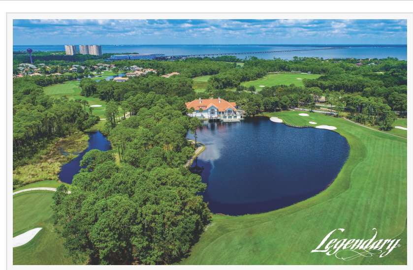
Regatta Bay Golf & Yacht Club

Regatta Bay Golf & Yacht Club, developed by Legendary LLC, has been esteemed as a top-tier golf destination, drawing both local enthusiasts and visitors in search of an exceptional playing experience. The ICONIC rating is bestowed upon only the most distinguished clubs that set the standard for ambiance and guest satisfaction. Merely 1% of properties worldwide are awarded the ICONIC designation.