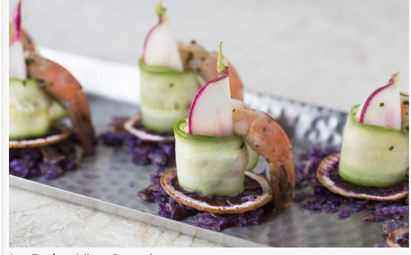
La Dolce Vita Catering

serving New York City, the Hamptons, and surrounding areas, sees the trend firsthand. Known for its high-touch service and refined approach to hospitality, the company has built its reputation by blending elevated cuisine with hands-on event coordination. From the first planning call to the final course served, the team works closely with clients to ensure every element runs smoothly.