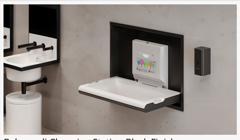
Babymedi Changing Station Black Finish

This press release can be viewed online at: https://www.einpresswire.com/article/823053965