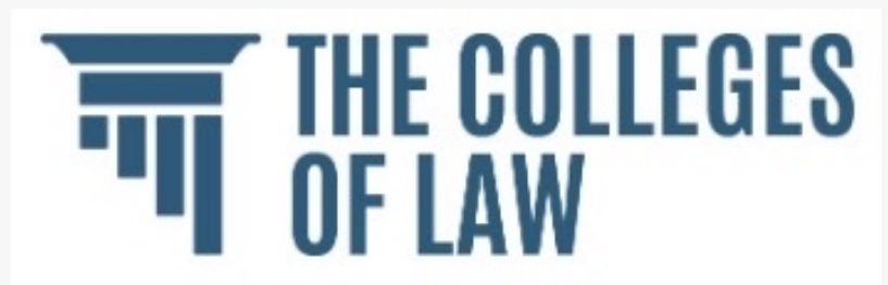
The Colleges of Law

This press release can be viewed online at: https://www.einpresswire.com/article/823100451