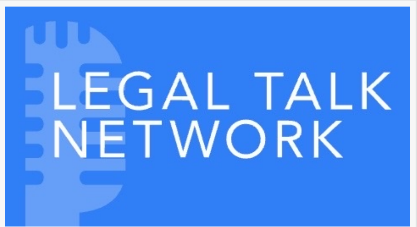
Legal Talk Network