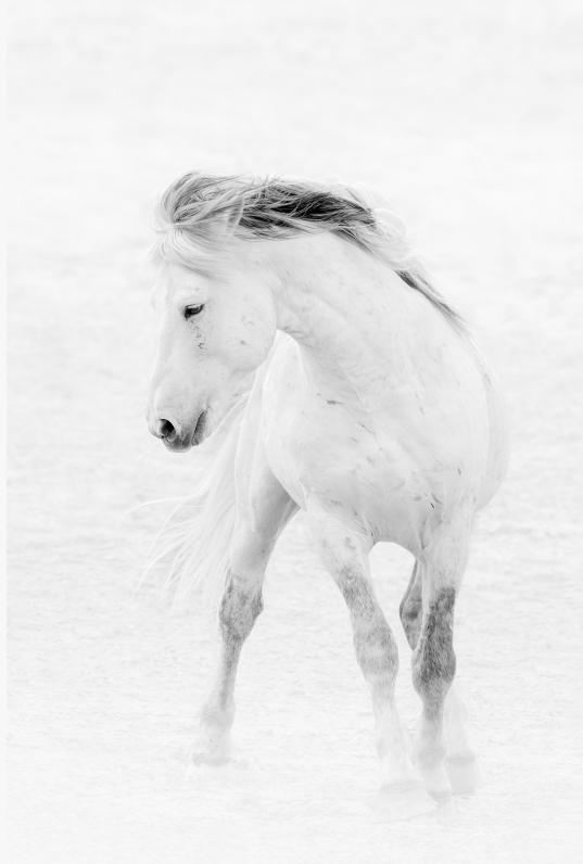
Wind Dancer Wild stallion in the wind and dust of the Wyoming desert.