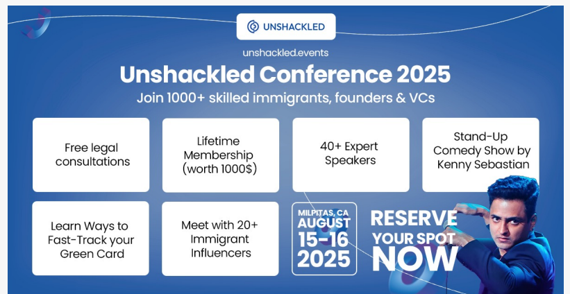
Kenny Sebastian at Unshackled Conference 2025