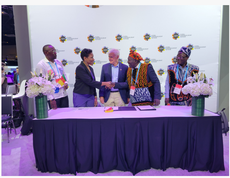
MAFE-GEN Cameroon MoU Signing

"This partnership isn't just about global goodwill – it's about creating real economic opportunities for Michigan women entrepreneurs,"