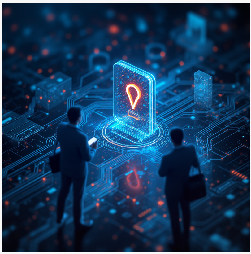
Internet of Things