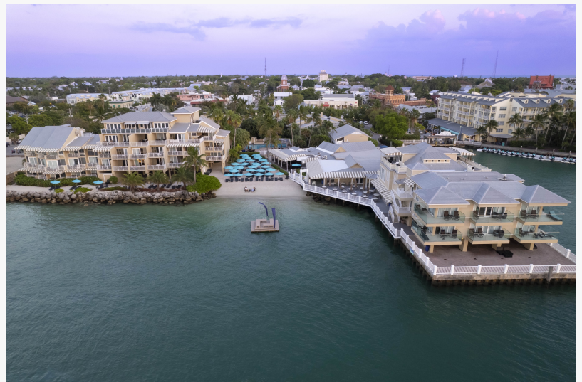
Pier House Resort & Spa Aerial

As the sun sets, the resort's signature restaurant, the oceanfront One Duval provides a culinary experience with fine dining considerations indoor or outdoor. With a continuously changing