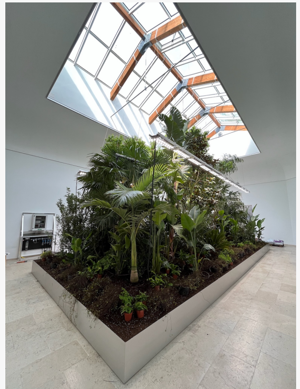
Vaisala CO2 sensors deployed in the Building Biospheres exhibit in the Belgian Pavilion at Architecture Biennale 2025

With its inception in 1895, La Biennale di Venezia is one of the longest-running cultural festivals in the world, and now features around 30 permanent pavilions established by different countries. In 2025, the goal of the Biennale Architettura will be to eliminate waste, recycle and circulate materials, and regenerate natural systems to demonstrate that the built environment can coexist harmoniously with the natural environment.