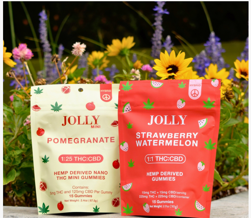
Jolly cannabis Strawberry Watermelon + Pomegranate gummy bundle

“Our mission has always been clear: create the cleanest, most compliant cannabis products in the country and make them accessible to consumers coast to coast,” the team added. “We’re not here for the short term—we’re building a brand for the long haul.”