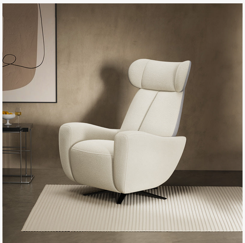
RE102 Power Recliner

Recognition at GOOD DESIGN® 2025 The RE102's inclusion in the GOOD DESIGN® 2025 Exhibition highlights its design and functionality. The awards, organized by The Chicago Athenaeum Museum of Architecture and Design, honor products that demonstrate innovation, sustainability, and user-focused engineering.