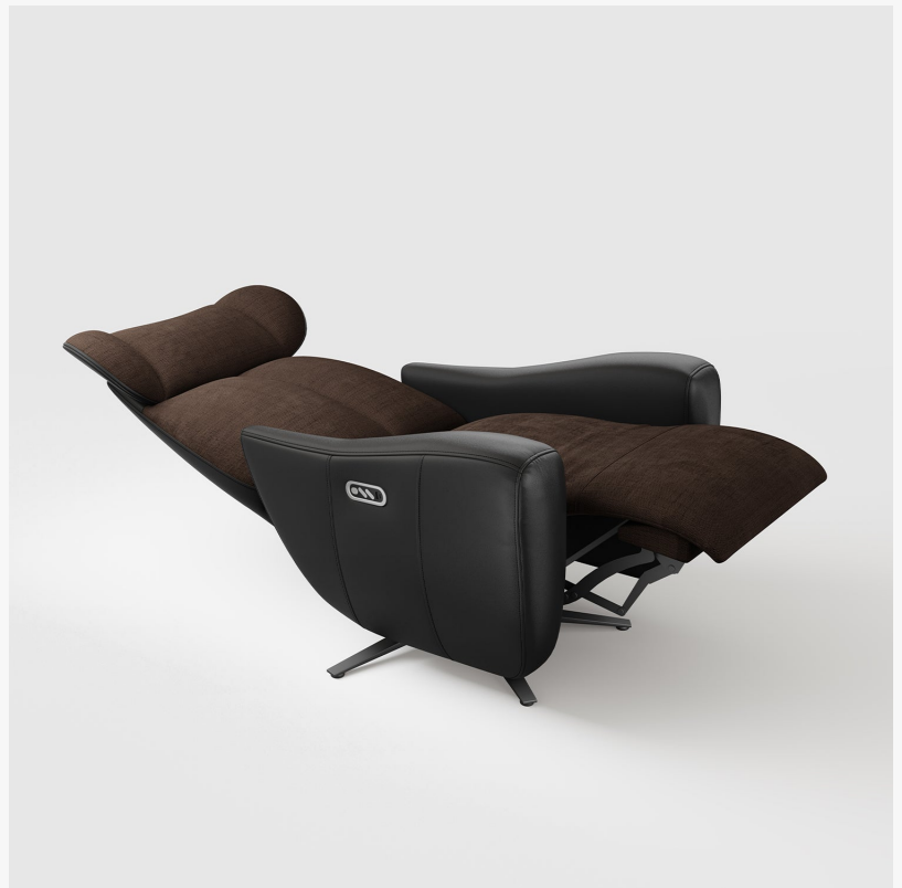
SwanSing Power Recliner Chair