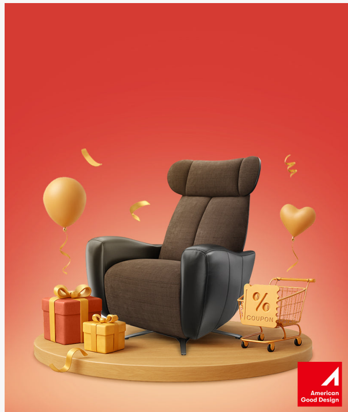
AlivingHome RE102 Power Recliner