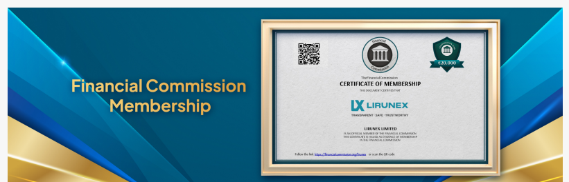
Lirunex Joins Financial Commission Membership