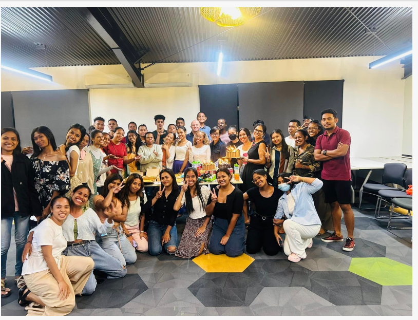
Graduates from the GEM Institute in Timor-Leste celebrate completing programs that build real-world skills for local and international employment.

"This was a major barrier for people seeking international education or employment. Now, they no longer have