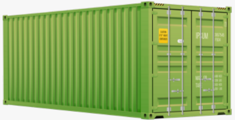
E-Waste Container Overview Image

As part of its larger mission, Computer Recycling's container program supports responsible electronics recycling , helping reduce the amount of e-waste sent to landfills while ensuring that materials like metals and plastics are recovered and reused. It's a win for clients, communities, and the environment.